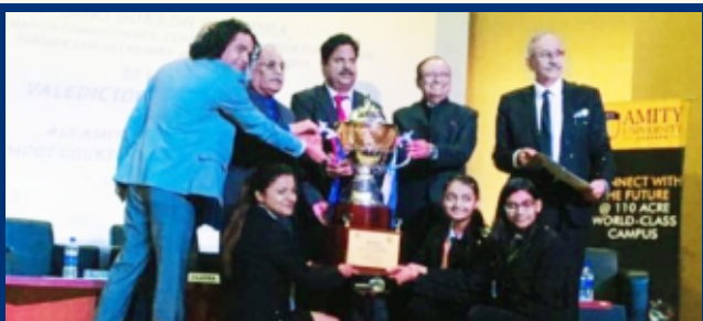
Our Students Winners at Amity University, Gurugram (2019)