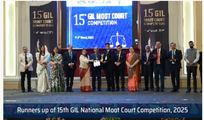
Runners up of 15th GIL National Moot Court Competition, 2025