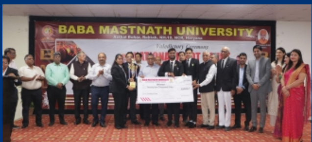
Our Students Winner at Baba Mastnath Univeristy, Rohtak (2024)

GIL Moot Court Society very actively organizes workshops for students to train them for National Moot Court Competitions. As a result, Geeta Institute of Law has won Five National Moot Court Competitions at various Colleges and Universities.