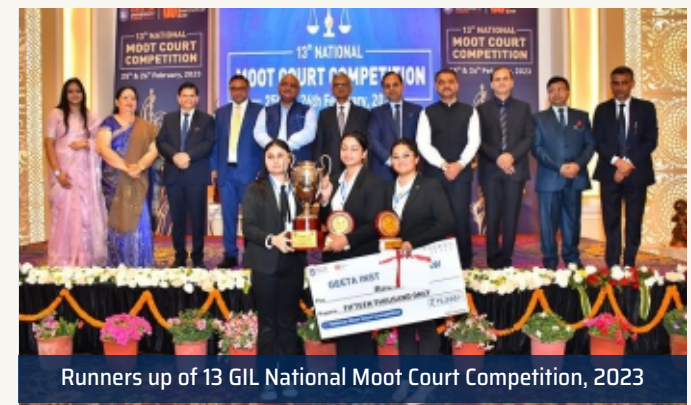
Runners up of 13 GIL National Moot Court Competition, 2023