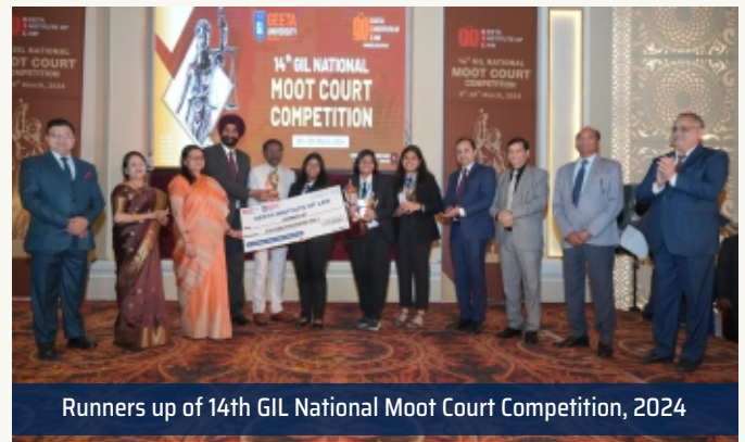
Runners up of 14th GIL National Moot Court Competition, 2024