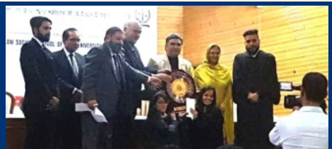
Our Students Winners at University of Kashmir (2018)