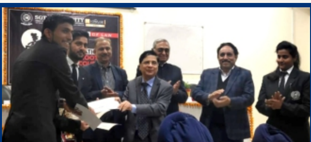
Our Students Winners at SGT University, Gurugram (2019) Receiving Trophy from Hon'ble Mr. Justice Dipak Misra Former CJI