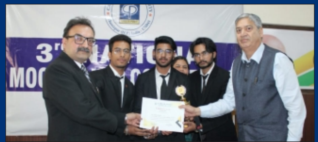
Our Student Semi-Finalists at Career Point University, Hamirpur