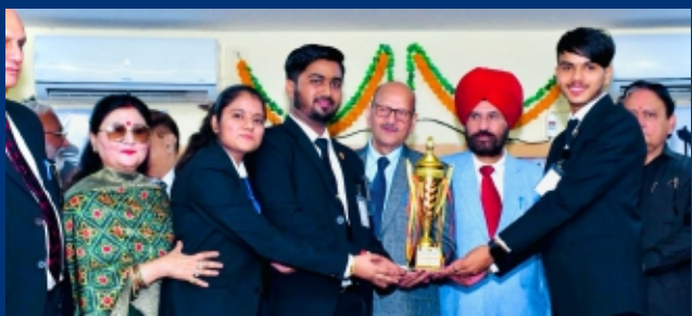
Our Student Semi-Finalist at St. Soldier's Law College, Jalandhar