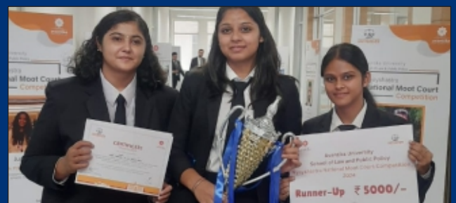
Our student Runner-Up at Avantika Nyayshastra National Moot Court Competition, Ujjain 2024