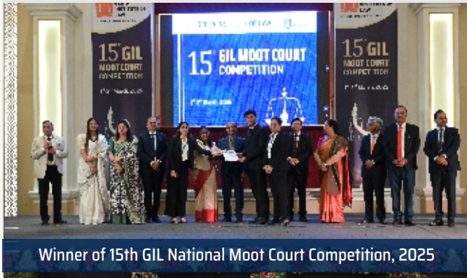
Winner of 15th GIL National Moot Court Competition, 2025