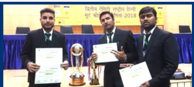
Our Students Winners at Amity University, Noida (2018)