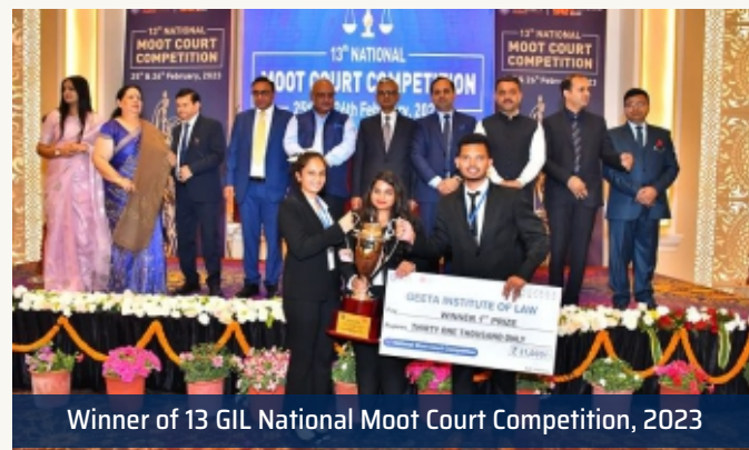
Winner of 13 GIL National Moot Court Competition, 2023