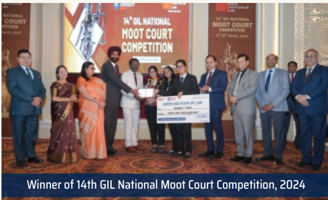
Winner of 14th GIL National Moot Court Competition, 2024