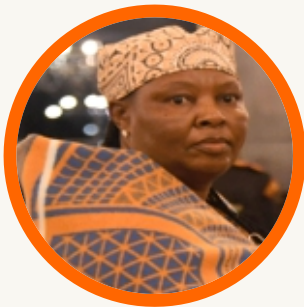
H.E. ADV. LEBOHANG VALENTINE MOCHABA

Ambassador - Republic of Zimbabwe to India