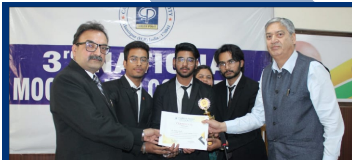
Our Student Semi-Finalists at Career Point University, Hamirpur