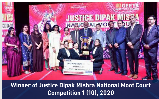
Winner of Justice Dipak Mishra National Moot Court Competition 1 (10), 2020