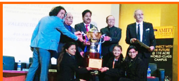
Our Students Winners at Amity University, Gurugram (2019)