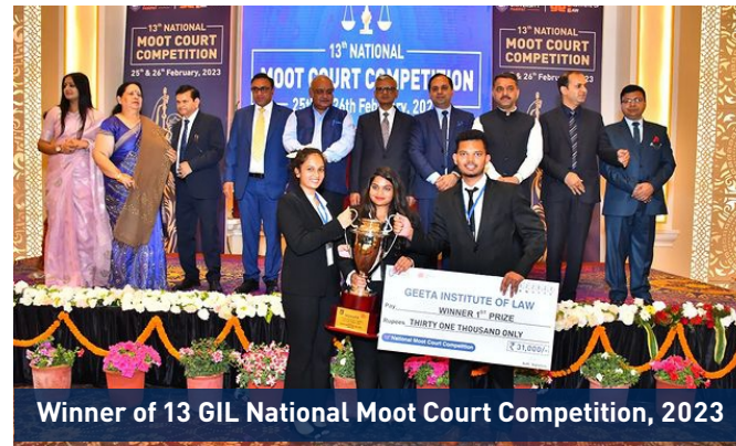
Winner of 13 GIL National Moot Court Competition, 2023