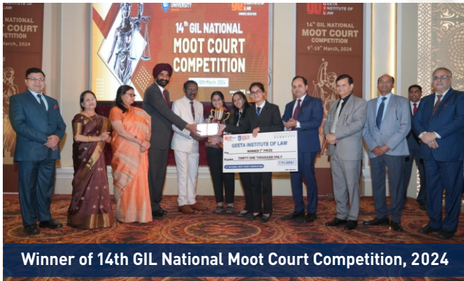
Winner of 14th GIL National Moot Court Competition, 2024