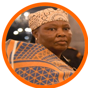
H.E. ADV. LEBOHANG VALENTINE MOCHABA

Ambassador - Republic of Zimbabwe to India