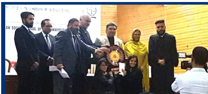
Our Students Winners at University of Kashmir (2018)