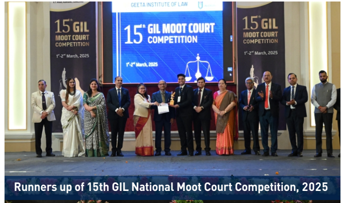
Runners up of 15th GIL National Moot Court Competition, 2025