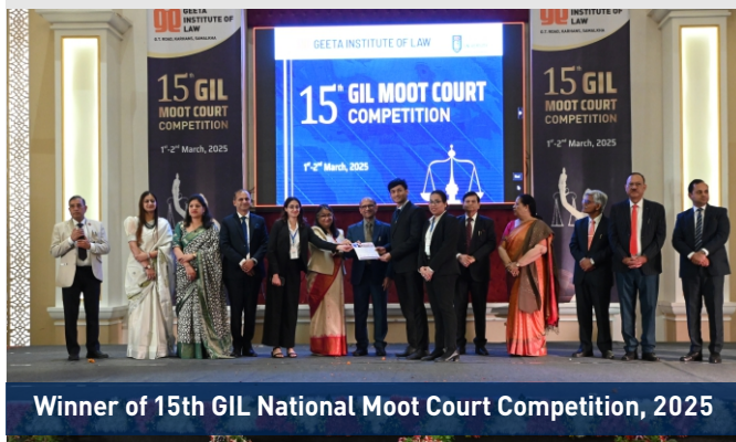
Winner of 15th GIL National Moot Court Competition, 2025