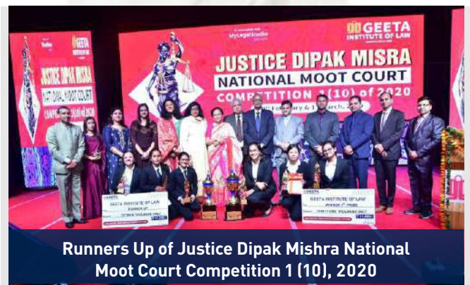
Runners Up of Justice Dipak Mishra National Moot Court Competition 1 (10), 2020