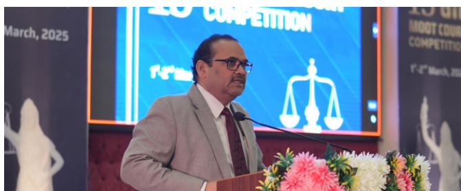
Hon'ble Mr. Justice J.K. Maheshwari, Judge, Supreme Court of India

Chief Guest @15th GIL National Moot Court Competition, 2025