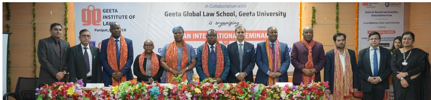
International Seminar 2024