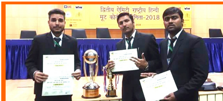
Our Students Winners at Amity University, Noida (2018)