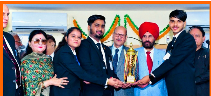
Our Student Semi-Finalist at St. Soldier's Law College, Jalandhar