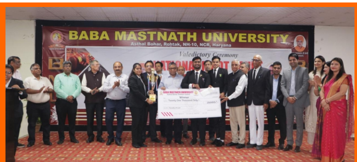
Our Students Winner at Baba Mastnath University, Rohtak (2024)

GIL Moot Court Society very actively organizes workshops for students to train them for National Moot Court Competitions. As a result, Geeta Institute of Law has won Five National Moot Court Competitions at various Colleges and Universities.