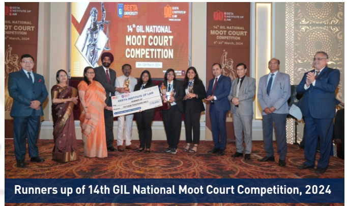
Runners up of 14th GIL National Moot Court Competition, 2024