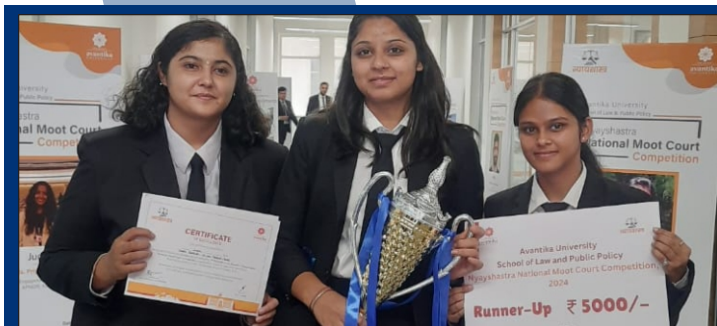
Our student Runner-Up at Avantika Nyayshastra National Moot Court Competition, Ujjain 2024