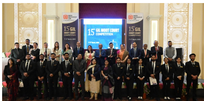
15th GIL National Moot court competition, 2025

Chief Guest @15th GIL National Moot Court Competition, 2025