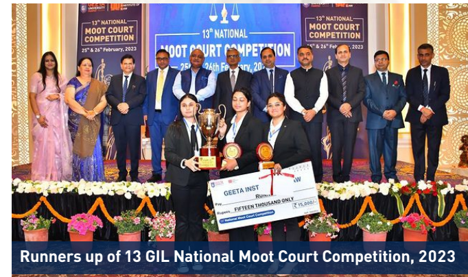
Runners up of 13 GIL National Moot Court Competition, 2023