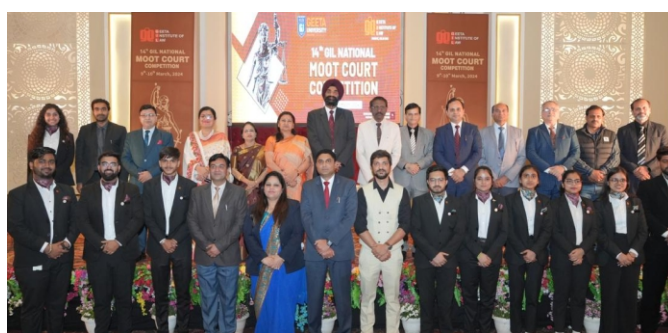
14th GIL National Moot court competition, 2024

Chief Guest @14th GIL National Moot Court Competition, 2024