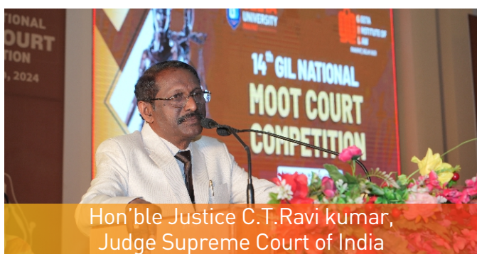
Hon'ble Justice C.T. Ravi Kumar, Judge Supreme Court of India

Chief Guest @14th GIL National Moot Court Competition, 2024