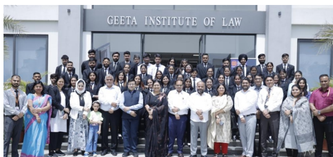
GIL Internship Fair was organised under the Theme "PRASHIKSHAN 5.0"

Chief Guest @13th GIL National Moot Court Competition, 2023