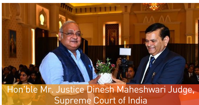
Hon'ble Mr. Justice Dinesh Maheshwari Judge, Supreme Court of India

Chief Guest @13th GIL National Moot Court Competition, 2023