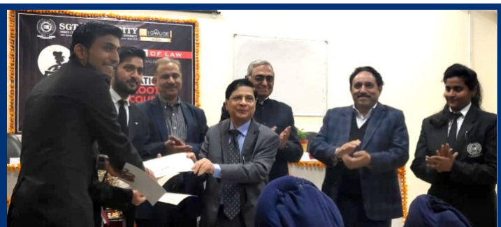
Our Students Winners at SGT University, Gurugram (2019) Receiving Trophy from Hon'ble Mr. Justice Dipak Misra Former CJI