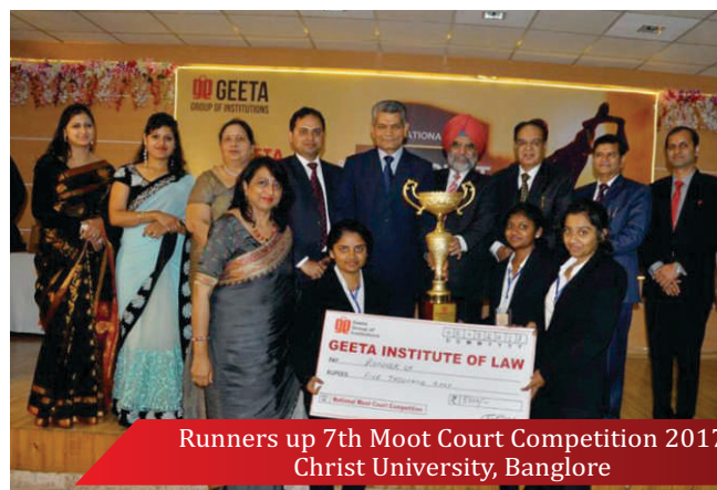
Runners up 7th Moot Court Competition 2017 Christ University, Bangalore