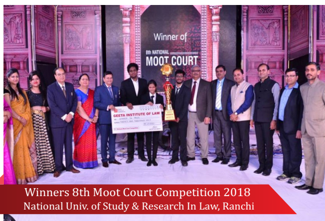
Winners 8th Moot Court Competition 2018 National Univ. of Study & Research In Law, Ranchi