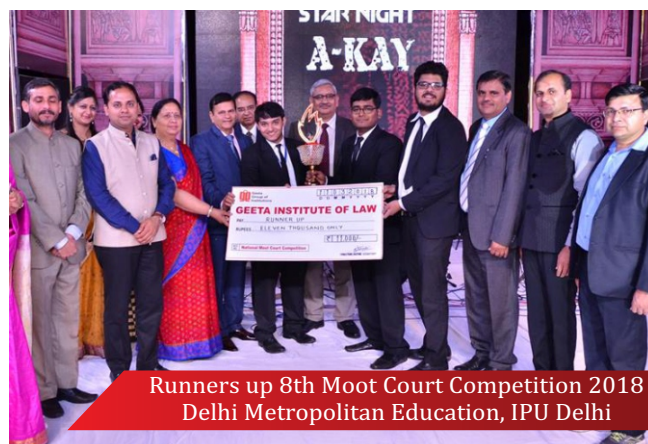
Runners up 8th Moot Court Competition 2018 Delhi Metropolitan Education, IPU Delhi