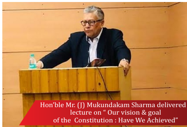
Hon'ble Mr. (J.) Mukundakam Sharma delivered a lecture on "Our vision & goal of the Constitution : Have We Achieved"