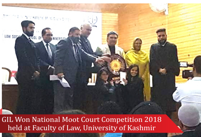
GIL Won National Moot Court Competition 2018 held at Faculty of Law, University of Kashmir