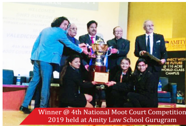
Winner @ 4th National Moot Court Competition 2019 held at Amity Law School Gurugram