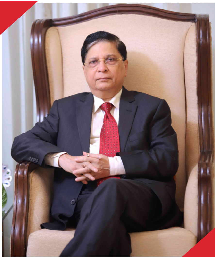
Hon’ble Mr. Justice Dipak Misra Former Chief Justice of India

Hon’ble Mr. Justice Dipak Misra has served as the 45th Chief Justice of India from 28th August, 2017 till 2nd October, 2018. Born on 3rd October, 1953, Justice Misra enrolled at the Bar in 1977 and practised at the Orissa High Court. He was appointed as an Additional Judge of the Orissa High Court in 1996 and was transferred to the Madhya Pradesh High Court where he was made a Permanent Judge in 1997. In December 2009, Justice Misra was appointed Chief Justice of the Patna High Court, serving until May, 2010, where he was appointed Chief Justice of the Delhi High Court. Justice Misra was elevated to the Supreme Court of India on 10th October, 2011 and assumed charge as the Chief Justice of India on 28th August, 2017. A former Judge of Orissa and Madhya Pradesh High Court and a former Chief Justice of Patna and Delhi High Courts, he is a bold and Humane Judge.