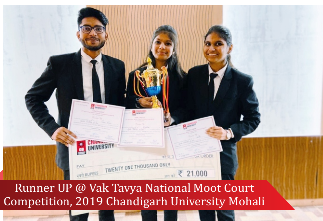
Runner UP @ Vak Tavya National Moot Court Competition, 2019 Chandigarh University Mohali