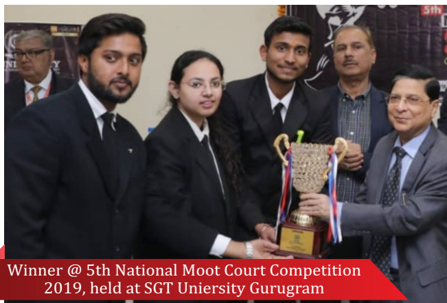
Winner @ 5th National Moot Court Competition 2019, held at SGT University Gurugram