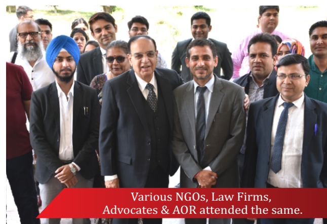
Various NGOs, Law Firms, Advocates & AOR attended the same.