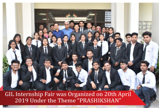
GIL Internship Fair was Organized on 20th April 2019 Under the Theme "PRASHIKSHAN"