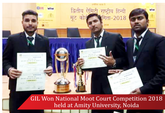
GIL Won National Moot Court Competition 2018 held at Amity University, Noida