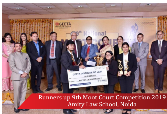
Runners up 9th Moot Court Competition 2019 Amity Law School, Noida