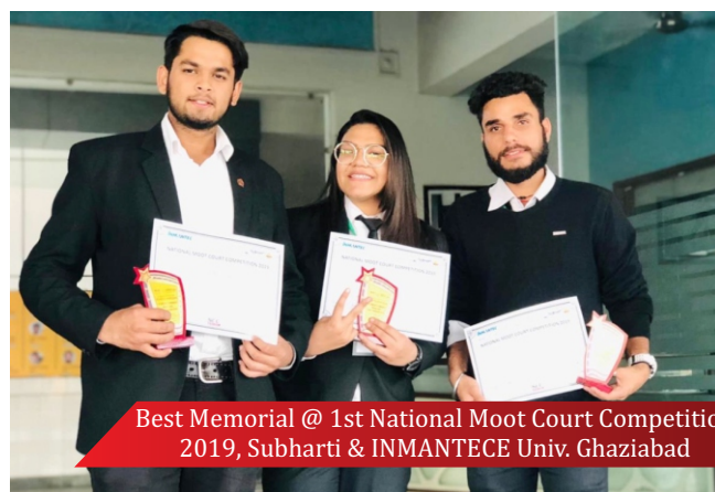
Best Memorial @ 1st National Moot Court Competition 2019, Subharti & INMANTECE Univ. Ghaziabad