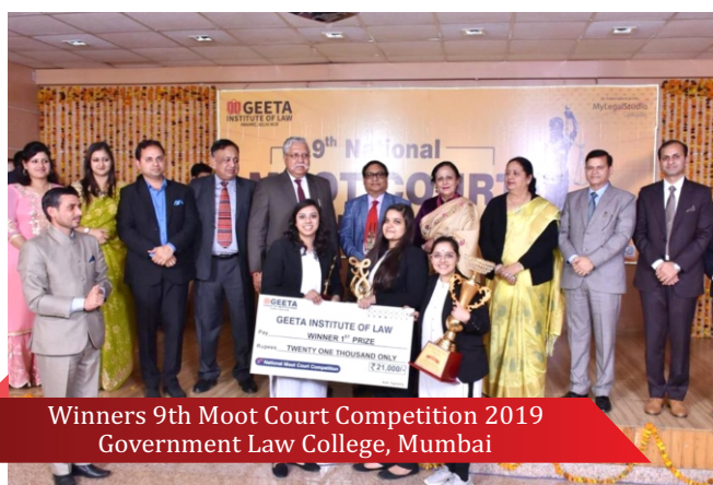
Winners 9th Moot Court Competition 2019 Government Law College, Mumbai