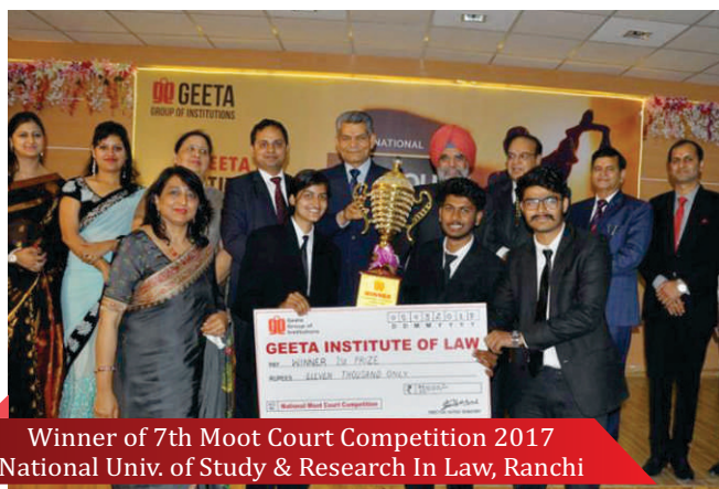
Winner of 7th Moot Court Competition 2017 National Univ. of Study & Research In Law, Ranchi