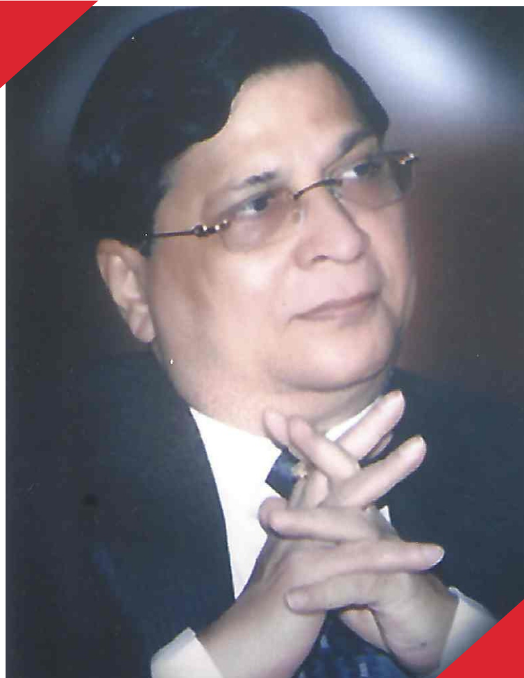
Hon’ble Mr. Justice Dipak Misra Former Chief Justice of India

As a judge of the Supreme Court of India, Justice Misra has delivered several landmark judgments. He has contributed immensely to Indian constitutional jurisprudence and each of